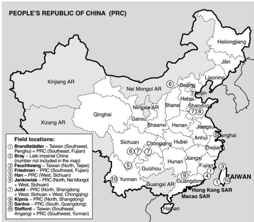
Map 1 Field locations map

of the process of social change going on in the mainland since the foundation of the PRC, including the current accelerated move towards globalization and industrial capitalism. We can only gesture here towards the enormous amount of historico-anthropological scholarship – partly triggered by a groundbreaking volume edited by Patricia B. Ebrey and James L. Watson (1986) – that shows how Chinese kinship and gender were constantly affected and transformed, during the high imperial era and the late imperial period, by political and economic developments, growing class inequalities and local warfare, and historical upheavals of state-making and ‘civilization-making’ (Bossler 1998; Birge 2002; Ebrey 1991; Faure 2007; Furth 1999; Ko 2005; Mann 1997; Sommer 2000; Szonyi 2002; Zheng 1992). 3 Beyond this question of the relation between kinship and history, we also think that our emphasis on transformation is more in tune with Chinese ancient forms of knowledge and philosophical concepts, which combined an emphasis on classification and categorization with the recognition of the pervasiveness of metamorphosis and transformation both across and within classes/categories. An example of this is the famous duality of yin and yang , which is constantly reshaping and reorganizing while always remaining recognizably the